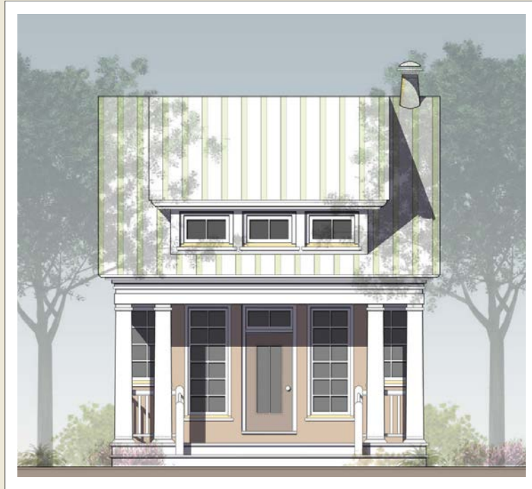
S Q U A R E E A V E