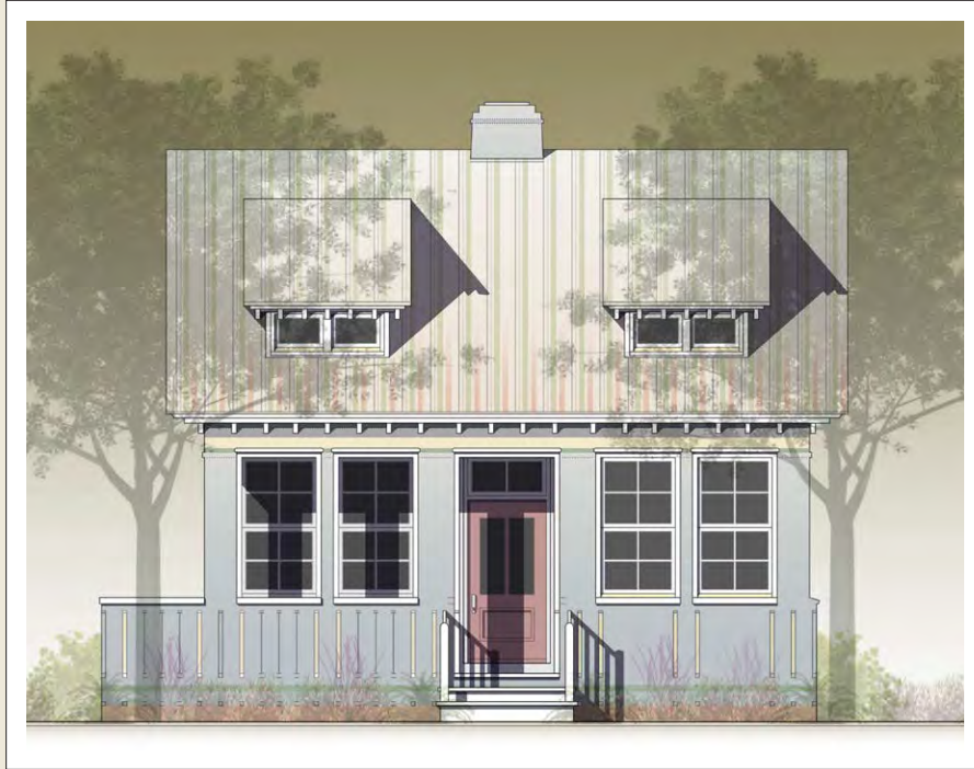
S Q U A R E E A V E