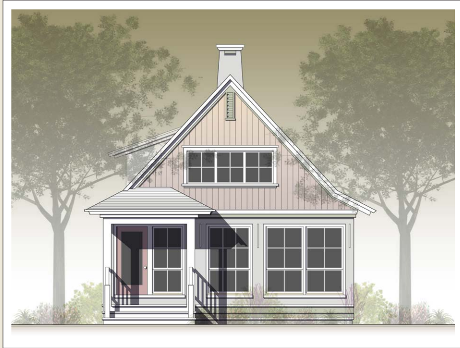
S Q U A R E G A B L E