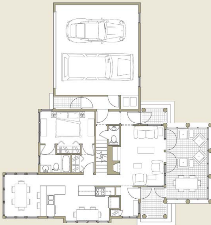
MAIN LEVEL 955 SF