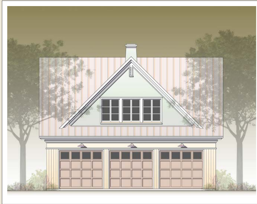
S Q U A R E E A V E G A B L E