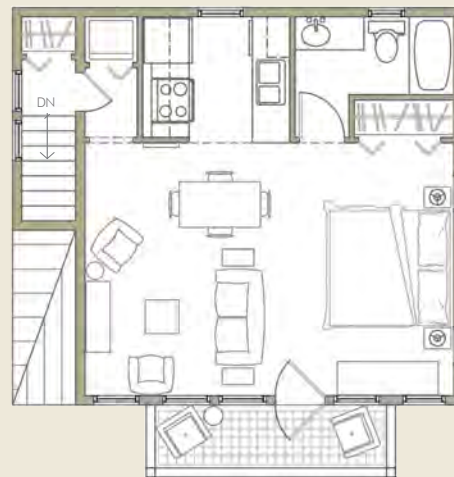
U P P E R L E V E L 4 2 0 S F