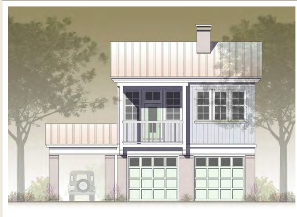
S Q U A R E E A V E