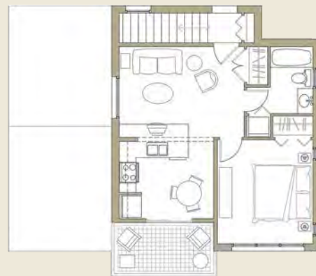
U P P E R L E V E L 565 SF