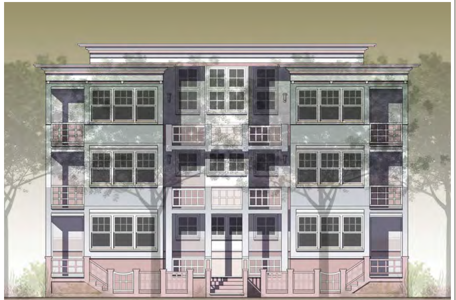
9 UNITS (3 UNIT FLOORPLATE)

UNITS: 9 LOT SIZE: 5,400 SF (54'x100' AVG.) NET DENSITY: 44.0 DU/AC DEVELOPABLE AREA 62.0 DU/AC BLOCK AREA F.A.R.: 0.62 (BLOCK AREA) TRANSECT ZONE: T.4 - T.5