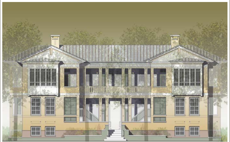
12 UNITS (4 UNIT FLOORPLATE)

UNITS: 8 LOT SIZE: 9,000 SF (90'x100' AVG.) NET DENSITY: 23.0 DU/AC DEVELOPABLE AREA 33.0 DU/AC BLOCK AREA F.A.R: 0.50 (BLOCK AREA) TRANSECT ZONE: T.4 - T.5