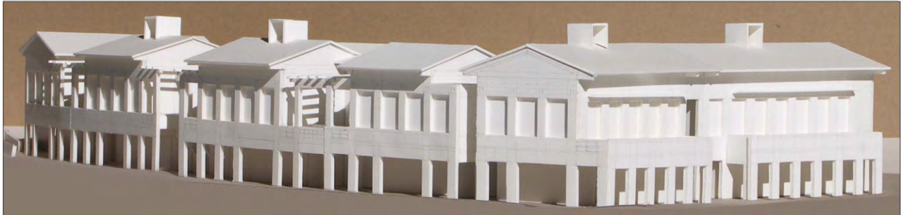
North East View