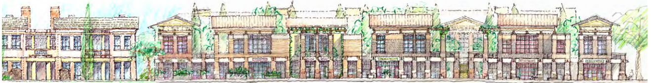
North East Commercial Block