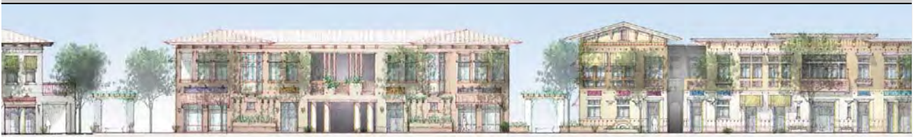
Pioneer Parkway Elevations