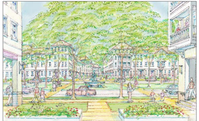
Street Rendering 2