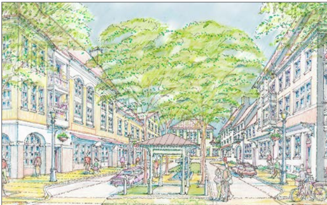
Street Rendering 1