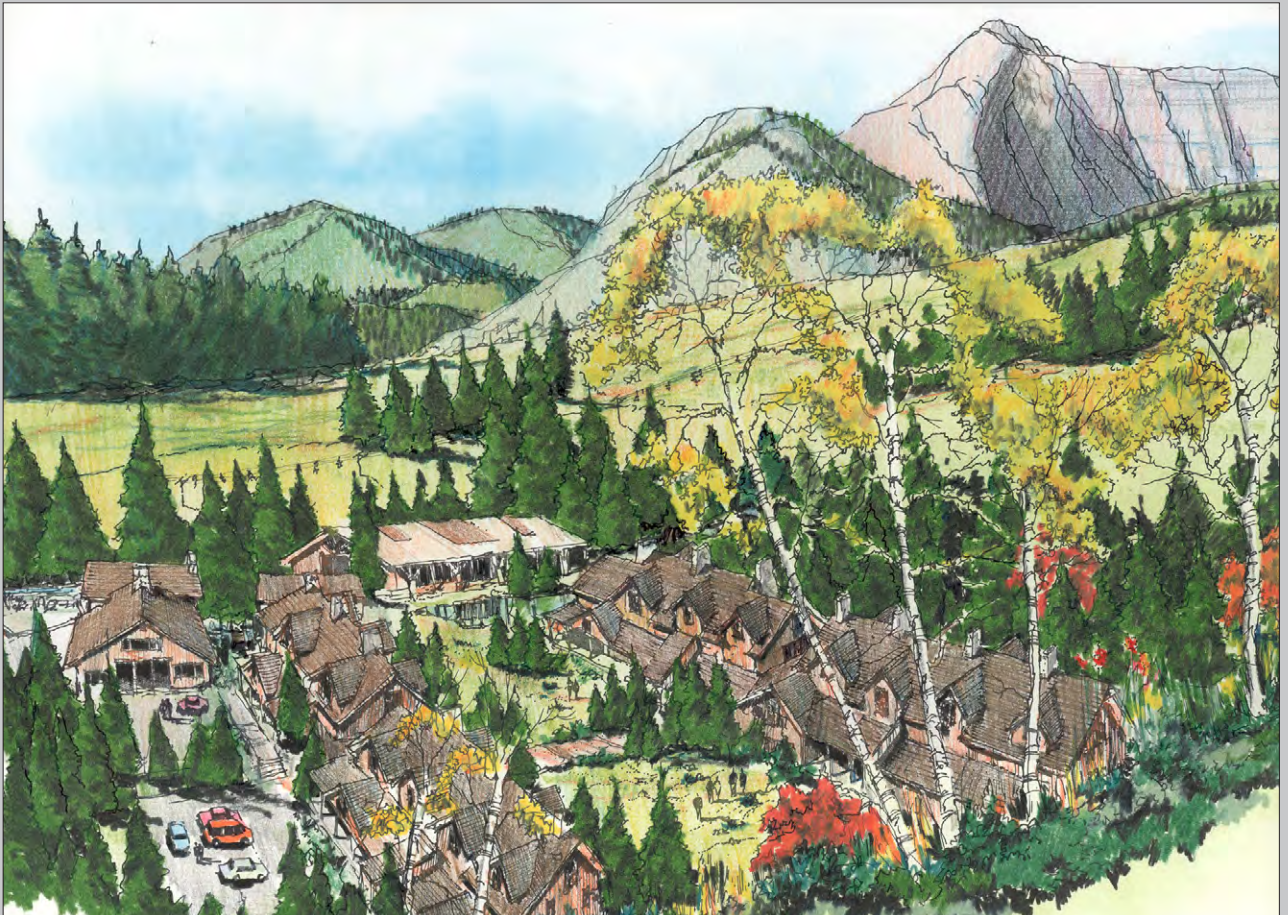
Rendering of Base Resort. (North End)

The north end of the Base Village is less accessible to the public, and has been planned for lodging and conference uses. The north parking area (shown at left) is allocated to this part of the village program. The sketch plan at the bottom of the page shows a part of the parking area taken over by additional lodging suites.