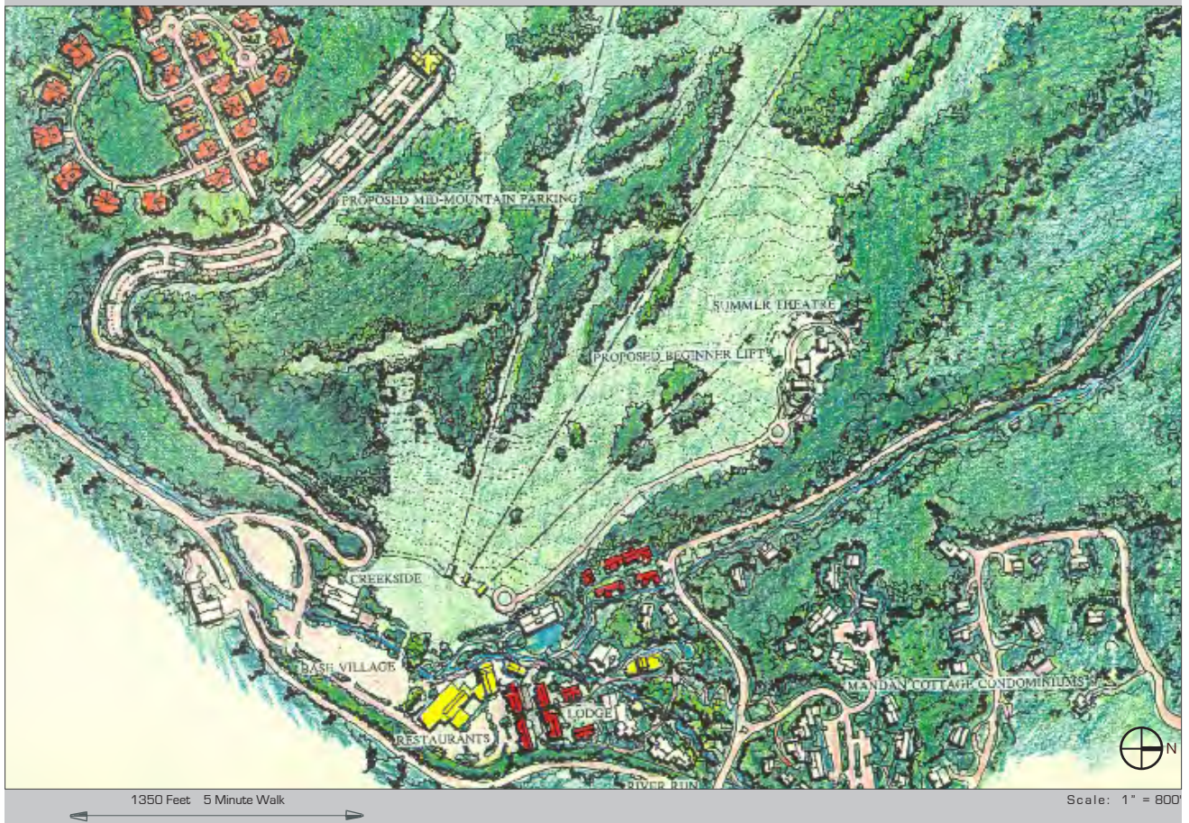
Rendered Base Site Plan