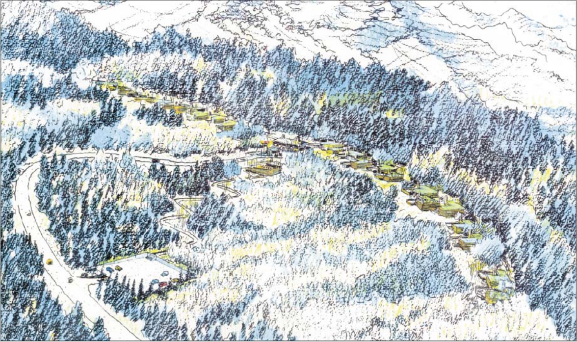
View from South East