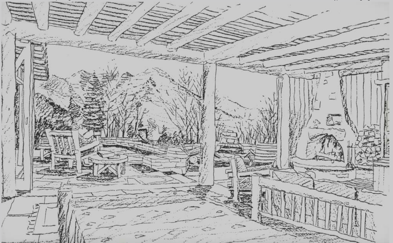
Typical Lodging Casita