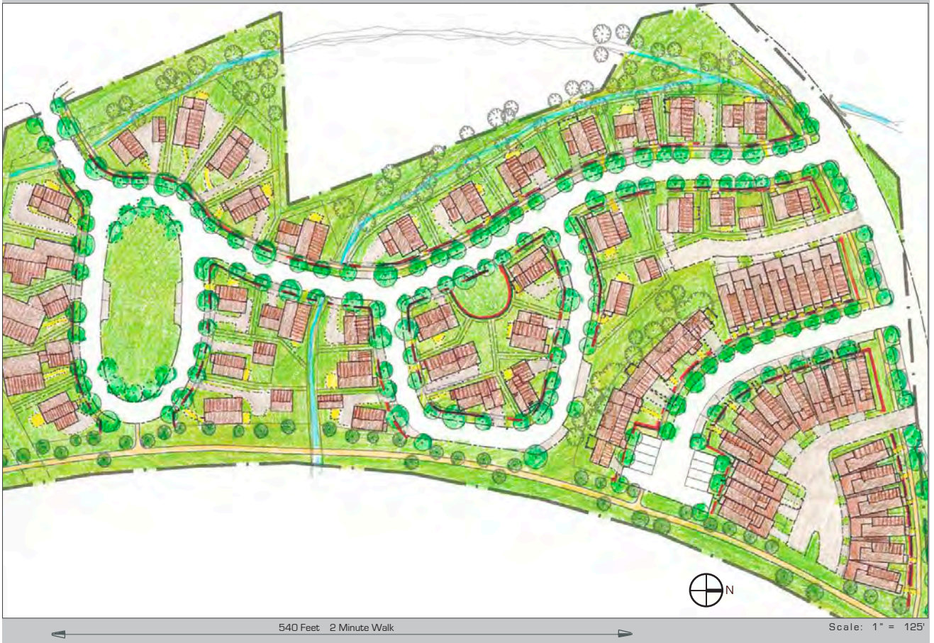
Rendered Site Plan