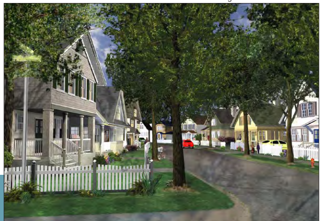
3D Model - Neighborhood Street View