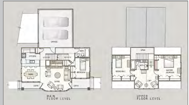
House Type A