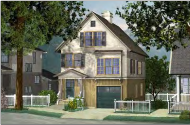
House Type D