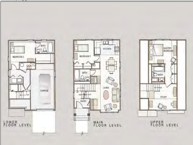
Main, Upper & Lower Level Floor Plans