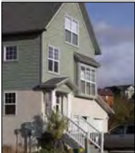
Prototype Model: House Type A