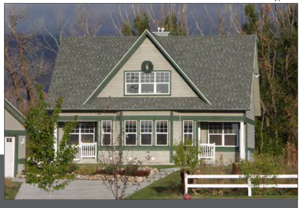
House Type A

HOUSES & HOUSING Greenfield Setting - Rural Context 10 Acre Site