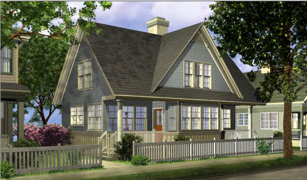
House Type A