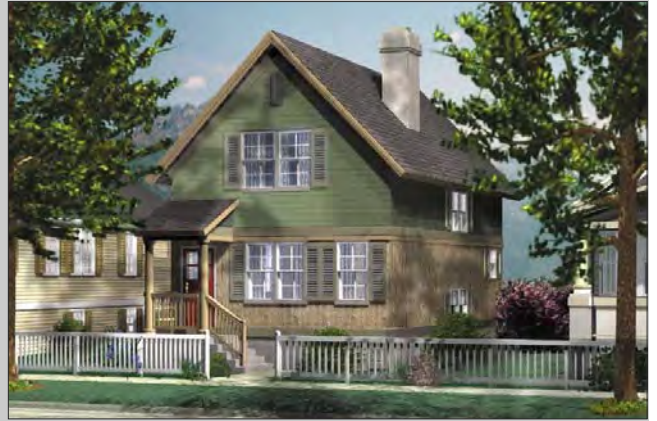
House Type E