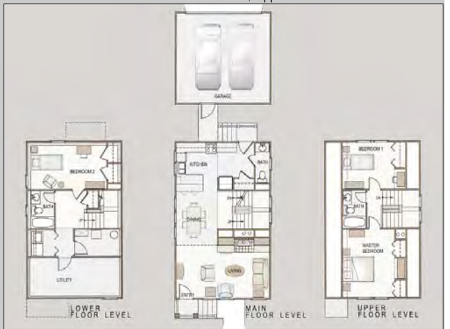
Main, Upper & Lower Level Floor Plans