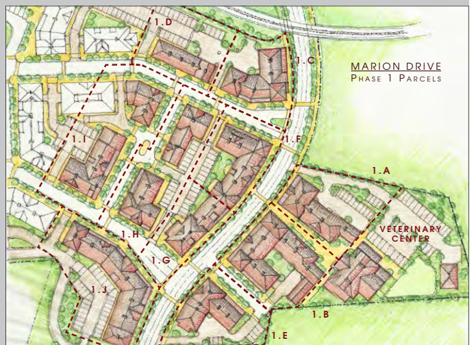
Phase 1 Village Center Plan