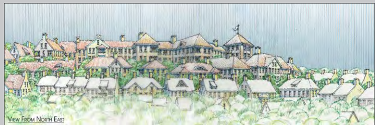
Residential Hill - Northeast View