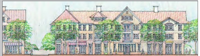
Street Elevation 1

T.O.D. transit villages require high densities to sustain the metropolitan rail system, and the majority of the neighborhood's building types are 3 stories or greater with mixed use or stacked residence programs. As a complement to the village, the west ('rear') half of the parcel is kept as open land and is currently in agricultural and wind turbine uses, and shall connect the village - with parks and play fields - to extensive public woodlands to the west.