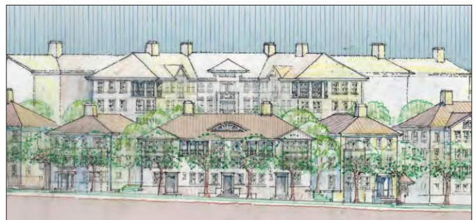
Northeast Elevation - North Hill

T.O.D. transit villages require high densities to sustain the metropolitan rail system, and the majority of the neighborhood's building types are 3 stories or greater with mixed use or stacked residence programs. As a complement to the village, the west ('rear') half of the parcel is kept as open land and is currently in agricultural and wind turbine uses, and shall connect the village - with parks and play fields - to extensive public woodlands to the west. Acting as a transportation hub for the town, and built with green design principles, Kingston Station will become model for local smart growth practices.