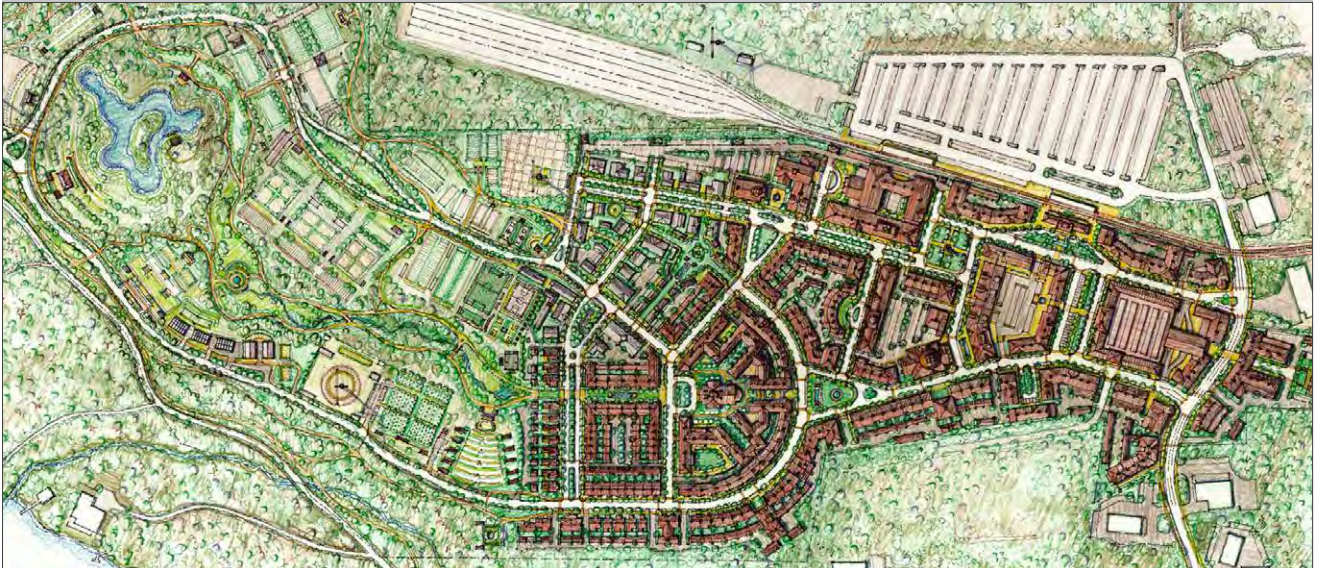
100 Acre Site