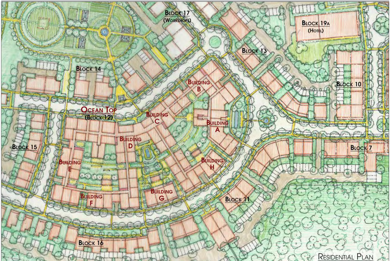
Residential Hill - Plan