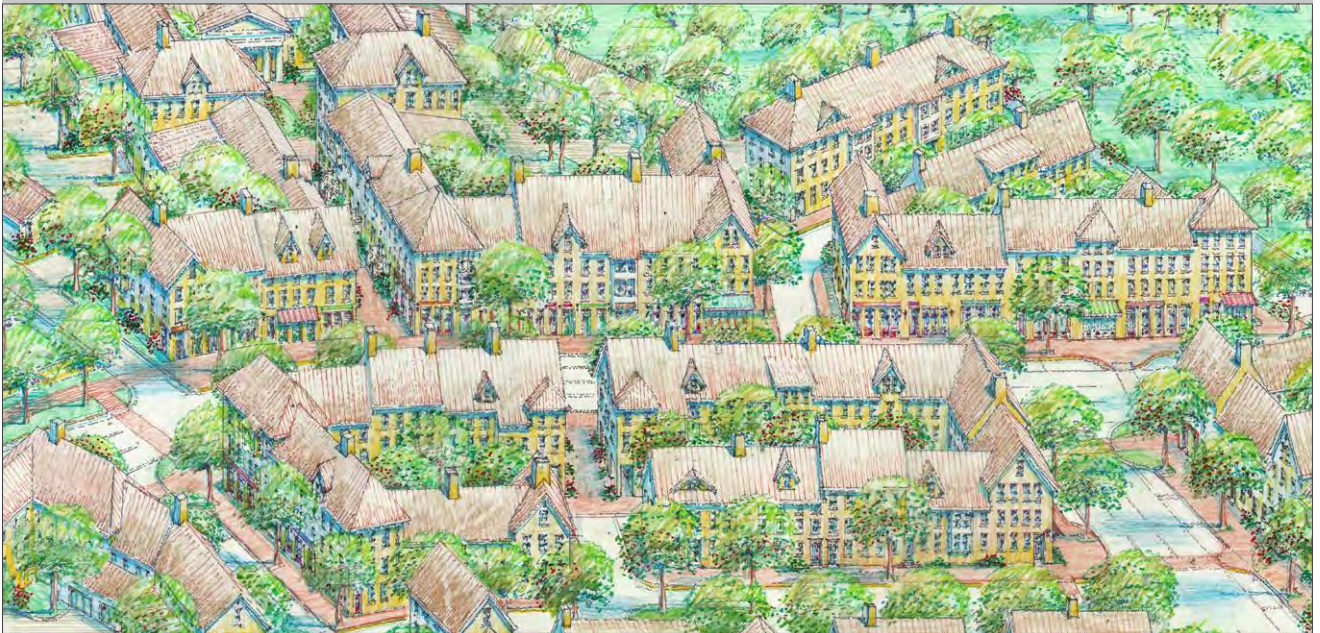
Isometric View - Phase 1