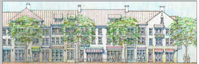
Street Elevation 2