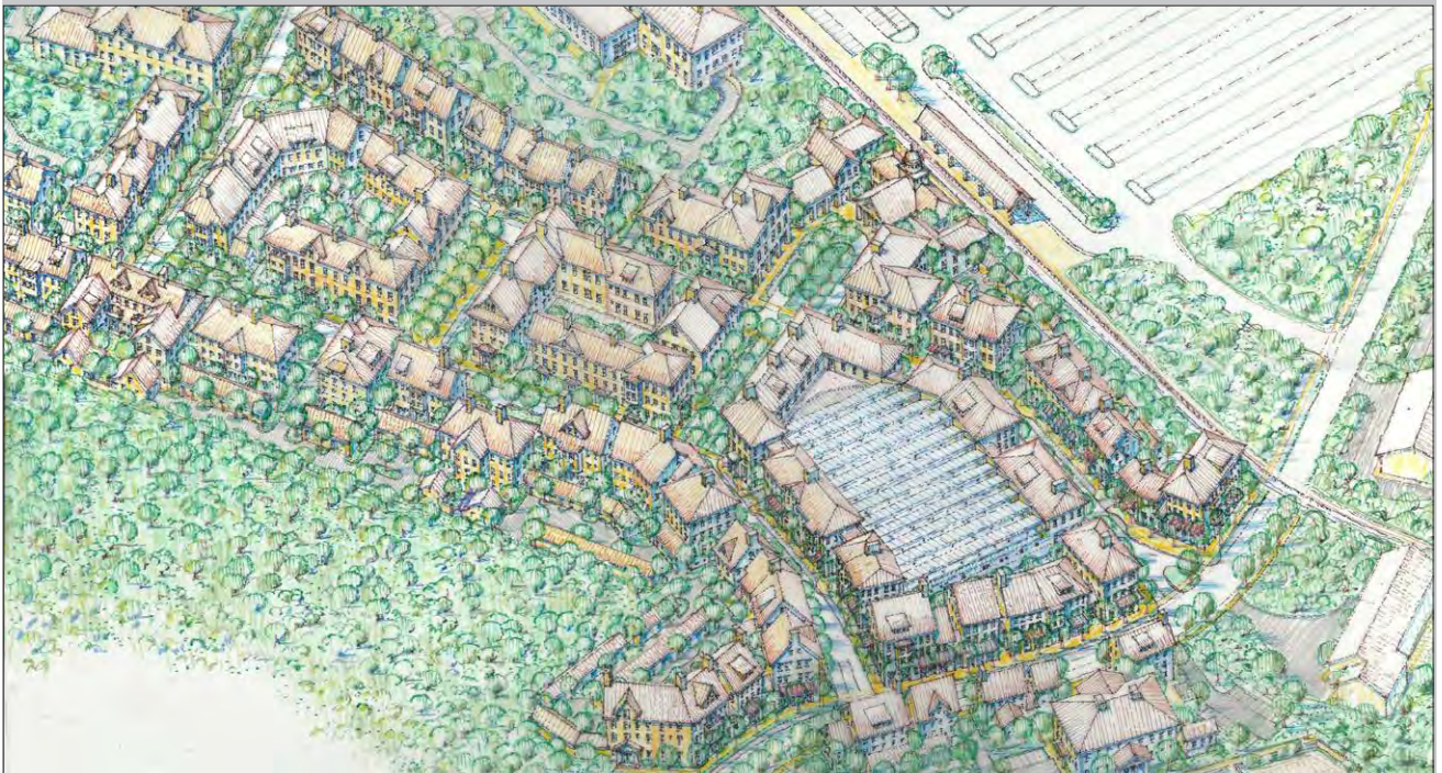
Isometric View - Village Center