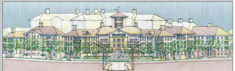
Residential Hill - North View