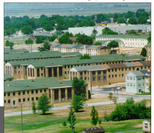
Photograph - Existing Conditions