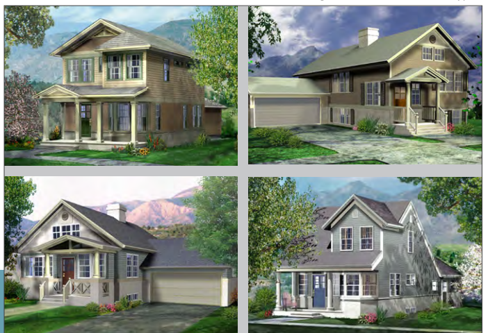
3D Models Rendered - Eagle Crest Small House Types