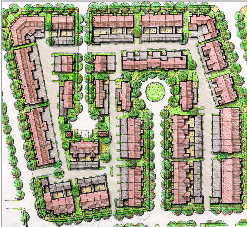
Multi-Family Block Plan