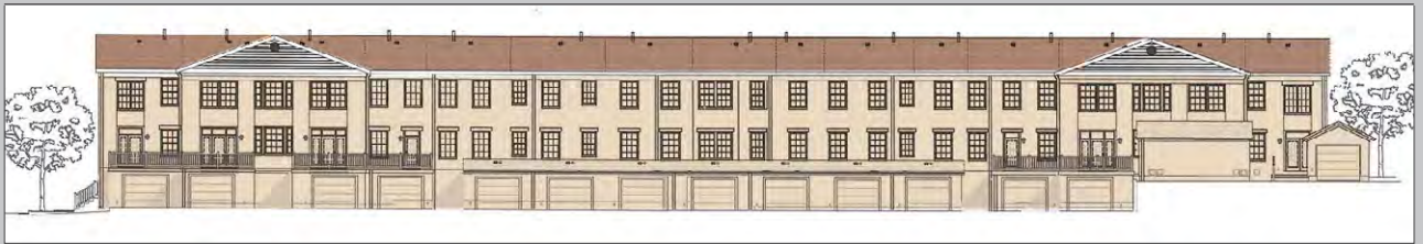
East and West Elevations - 15 Townhouse Units