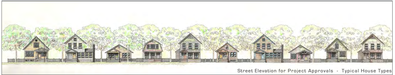
Street Elevation for Project Approvals - Typical House Types