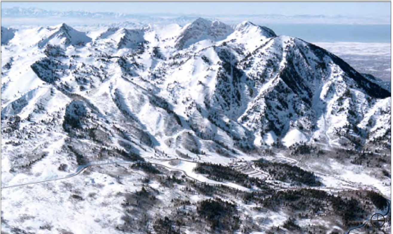
Scale: 1" = 6,000'