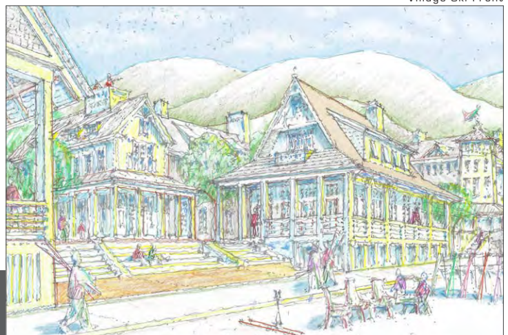
Village Ski Front