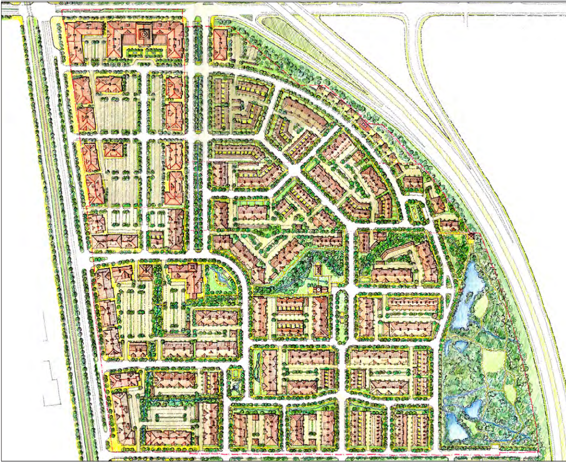
Rendered Site Plan