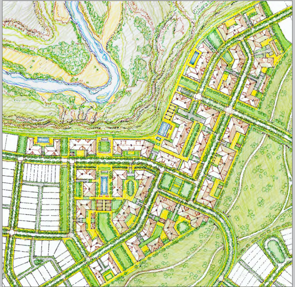
Resort Center Plan

A variety of dwellings are within each neighborhood (3/4 ac. estate lots at edges to stacked units at 20 du/ac. in the core) and will have a range of pricing. Hurricane is a gateway town to Zion National Park. In addition to 430 lodging units, many residences will be second homes.