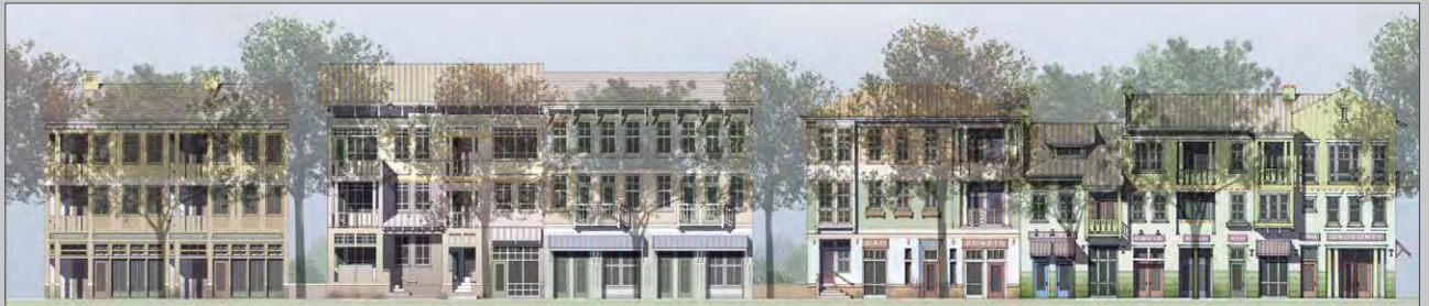
Higher Density Street Elevation