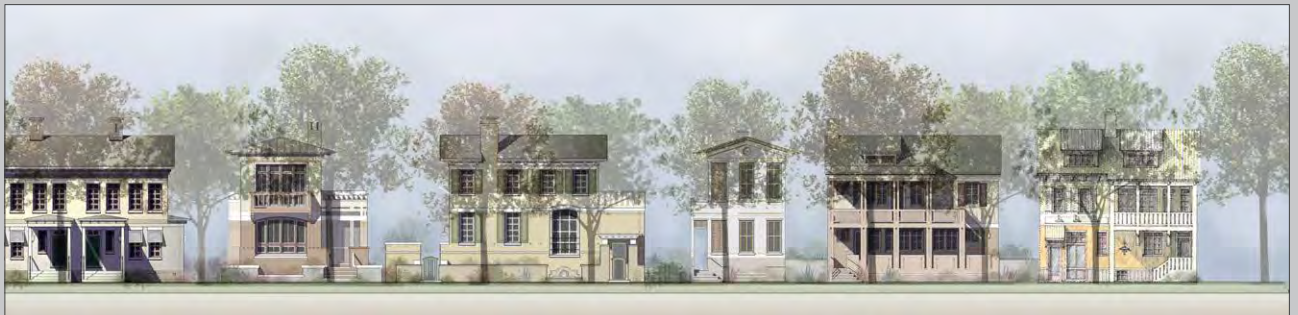
Lower Density Street Elevation