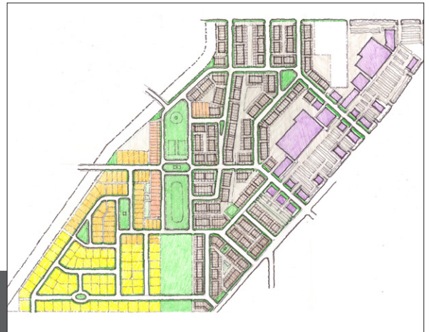
East Porch looking towards Duxbury Bay