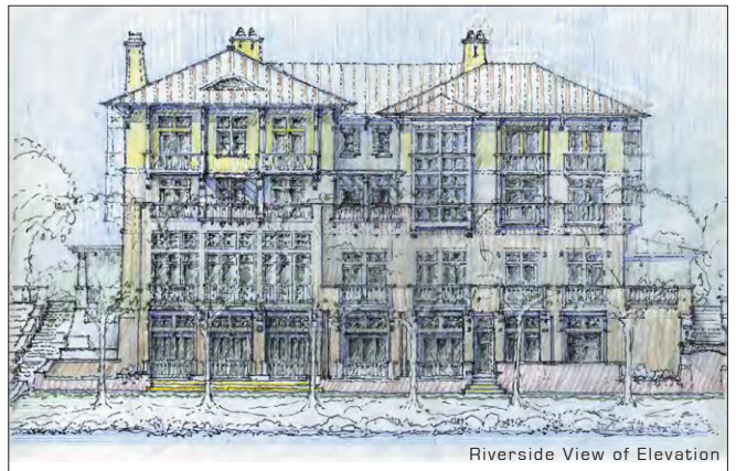
Riverside View of Elevation

Twenty four small suites, configured to create larger suites when combined and "locked off", are complemented by hotel amenities of store, spa, and conference rooms.