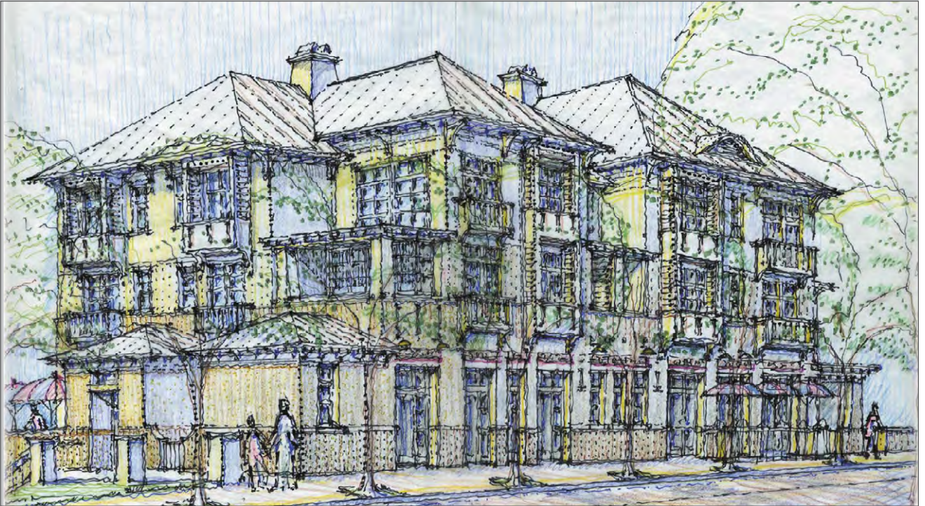
Street View Elevation

The second phase of building for this cottage, creating a separate suite of rooms for the extended family, completes an enclosure around a raised earth platform (required by Massachusetts Health Code regulations for drainfields near the high tide line). The lower volume reflects the New England lineage of "lean-to's and add-ons", which are clearly secondary to the main building form. The garage shall be located behind the stucco walls of the earth platform, underneath the one story bedroom wing.