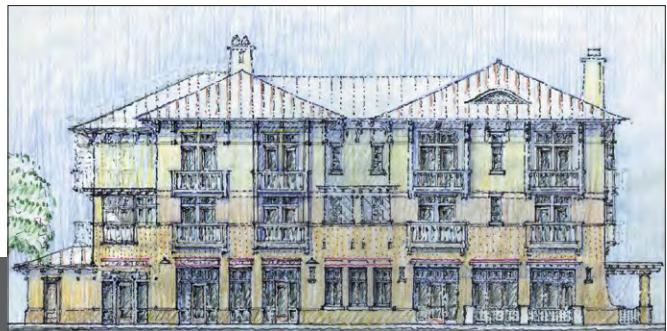
West View Elevation

COMMERCIAL & RECREATION Neighborhood Setting - Greenfield Context 0.25 Acre Site