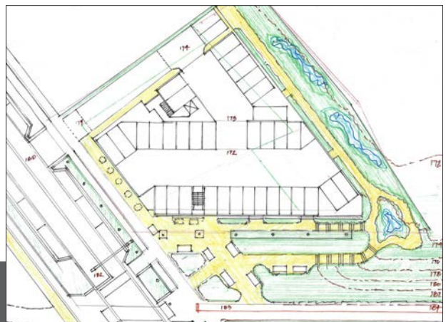
Parking Floor Plan