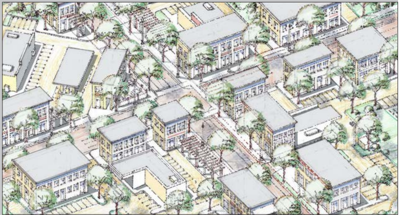
Aerial View 2