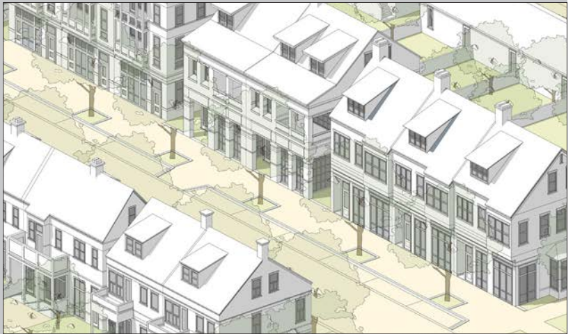
Aerial View 1