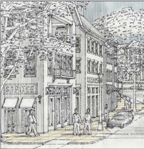
Street View 1