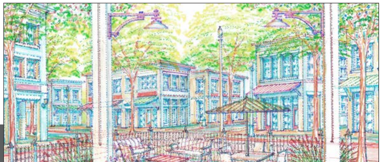
Street Corner View