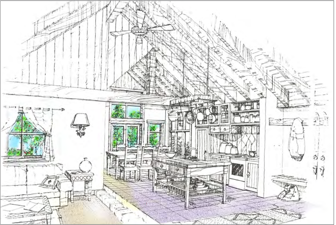
Marketing Drawing - Two Bedroom / Main Space