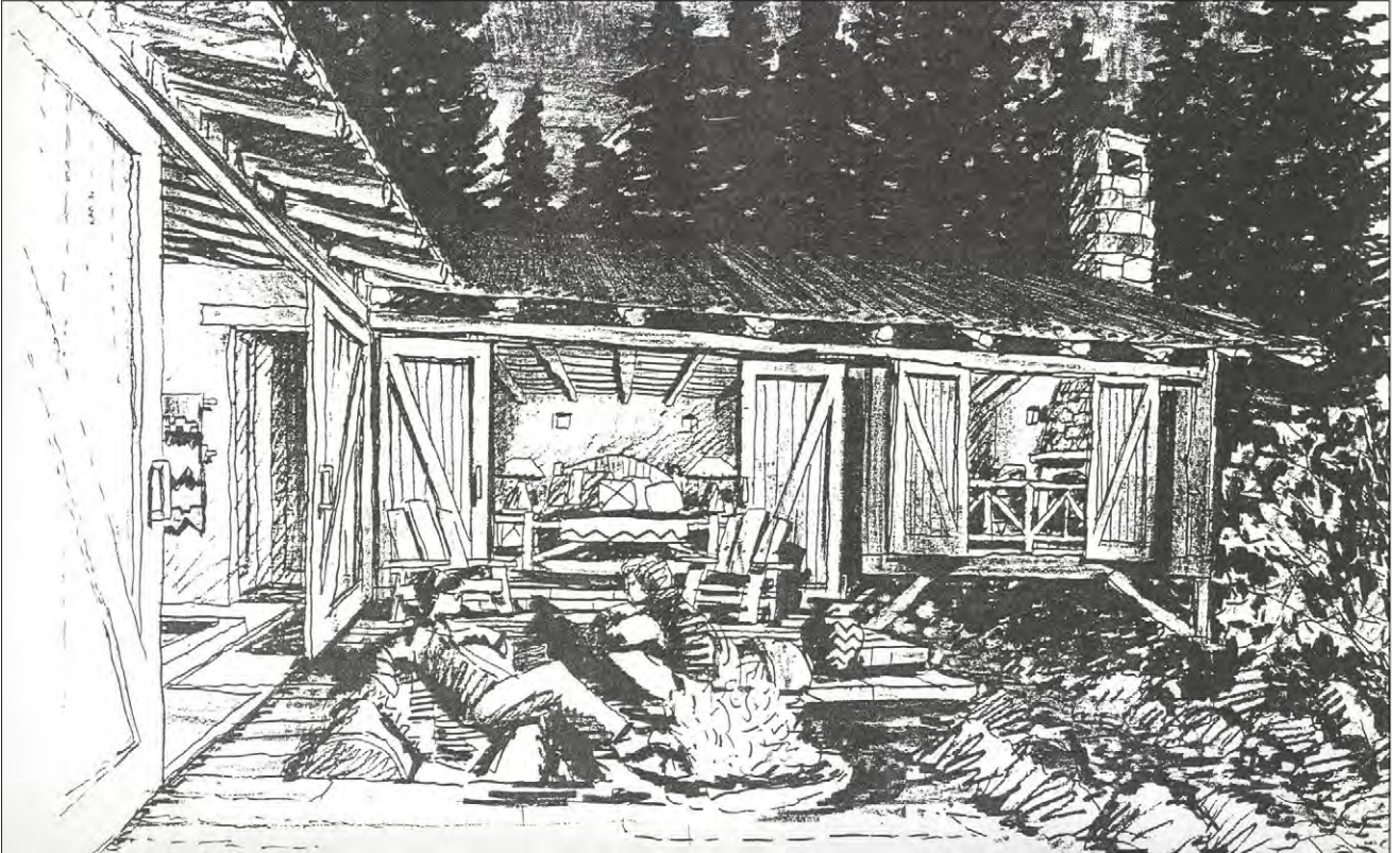
Night View Along Creek