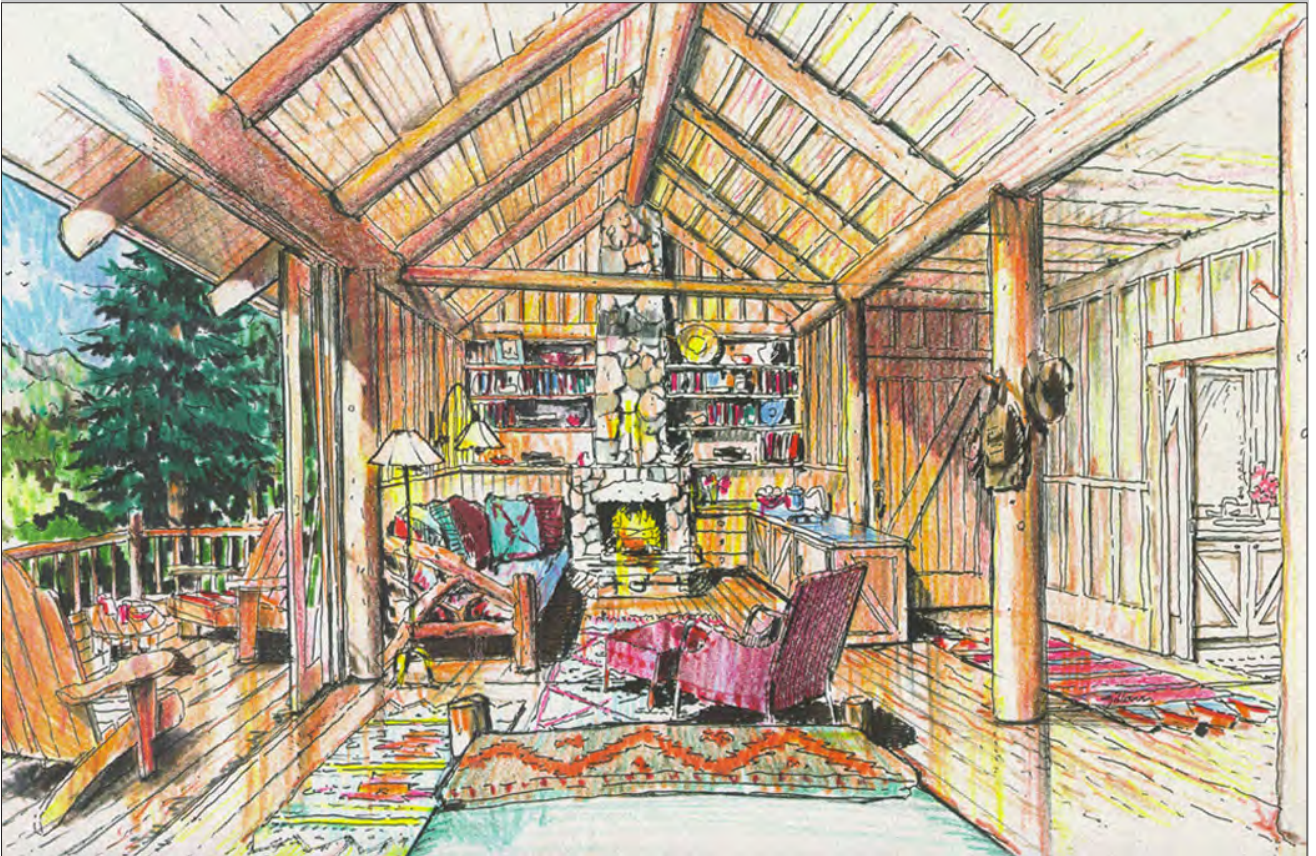
Concept Rendering - Living Room