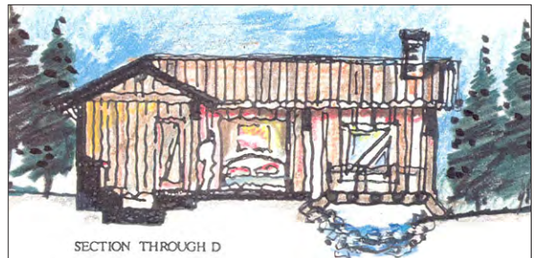
SECTION THROUGH D

The cabins (Unit Type D) closest to the watercourse incorporate one ell of the plan to span the creek. Other units (Unit Types A, B, C) were set against a steep hillside that provided ski-in access from the trails leading to the base lifts.