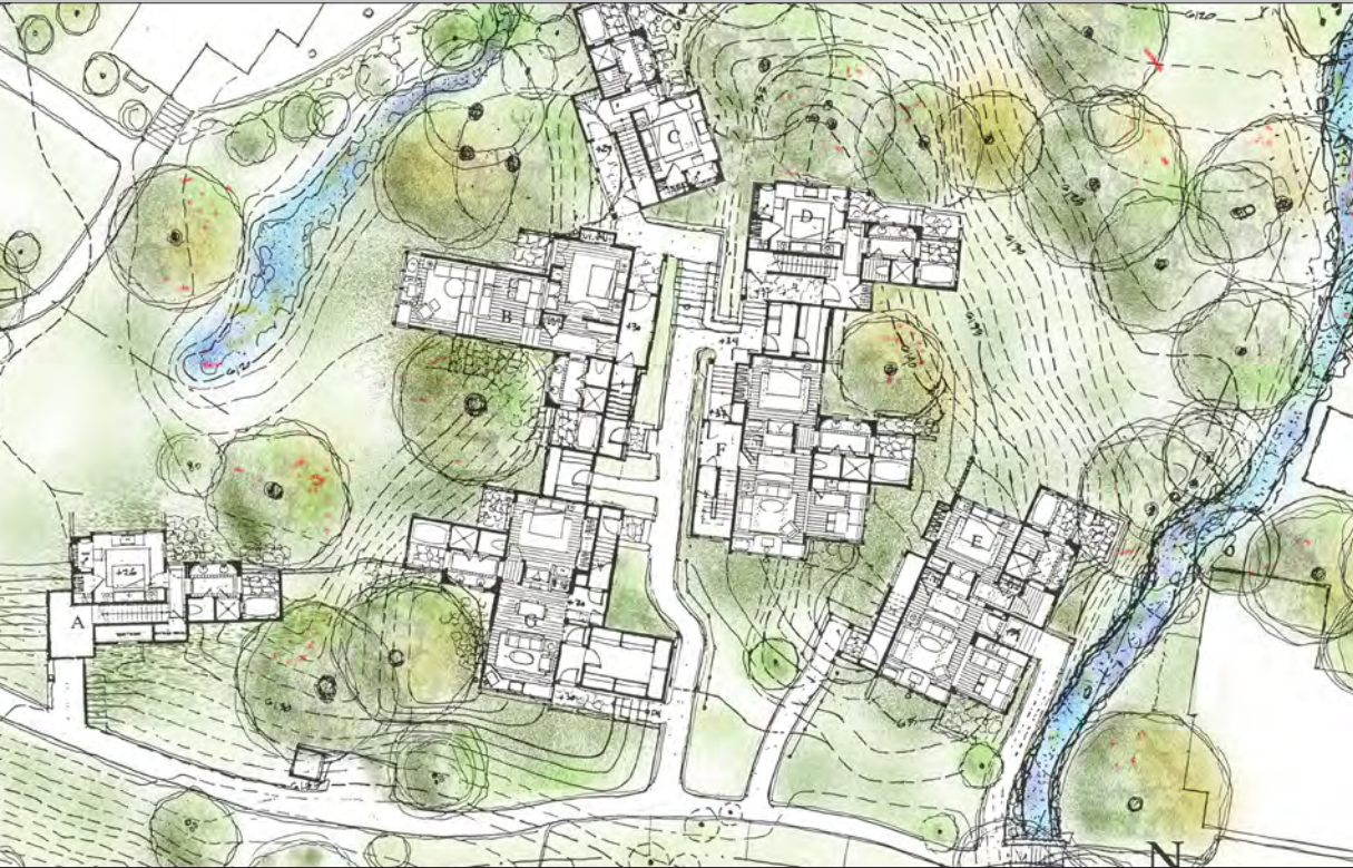
Schematic Site Plan