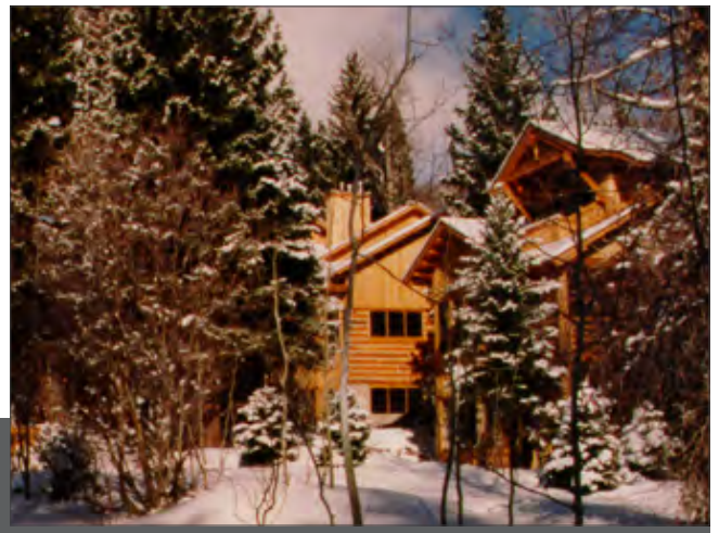
View from Southwest

The twenty four units were grouped into three buildings and set against a steep hillside. The downhill elevations of the stacked units were tall for the scale of the Base Village, but were effectively minimized by their integration with mature conifers, overlooking a creek, and acting as background buildings.