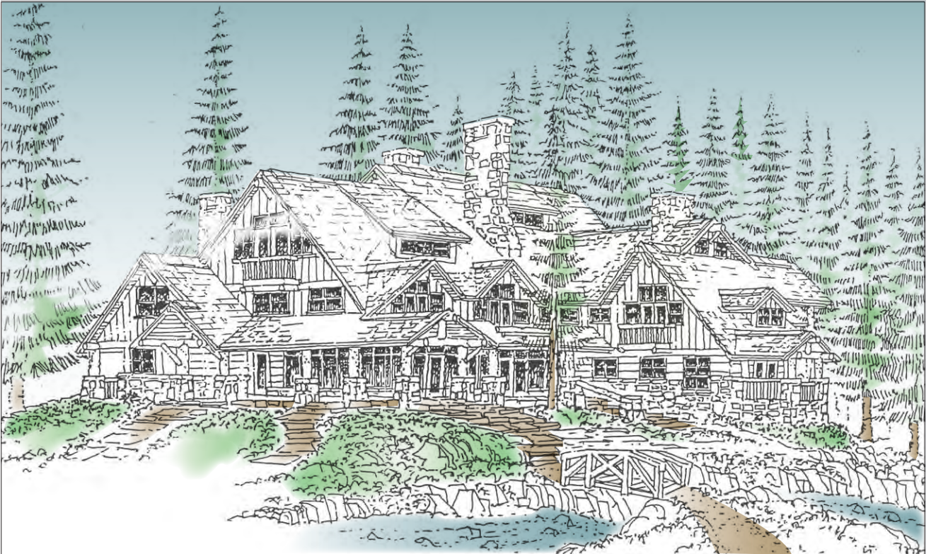
Concept Rendering - Main Building