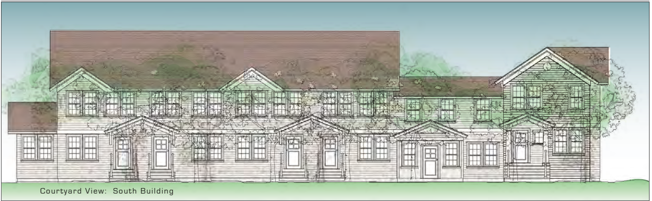
Courtyard View: South Building