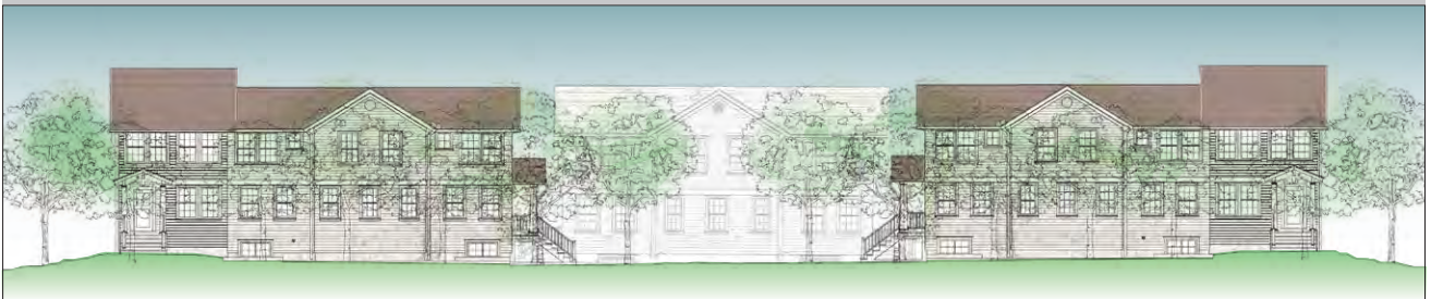
Street View: North and South Buildings