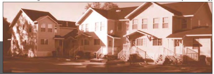
South Elevation (to Parking)