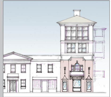
Massachusetts Avenue - Street Elevation