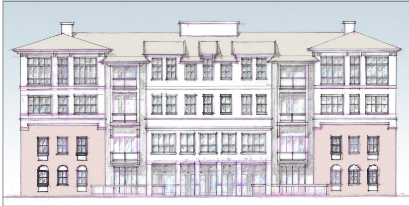
Long Elevation to Public Space