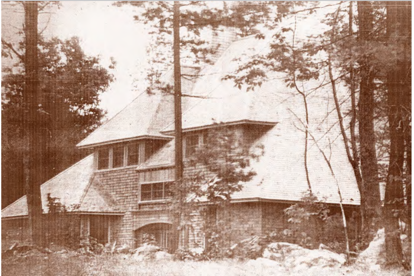
Photograph of Front Elevation