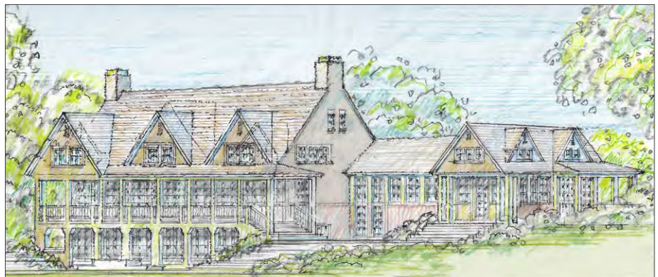
North West View

The 7,200 s.f. house unfolds to the west and north views of Ben Lomond and Nordic Valley, with broad porches and patios. The pool and hot tub terrace sits a half level between the main floor and creekside yard and field.