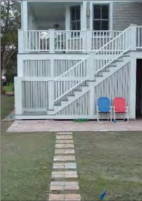
View to North East Porch