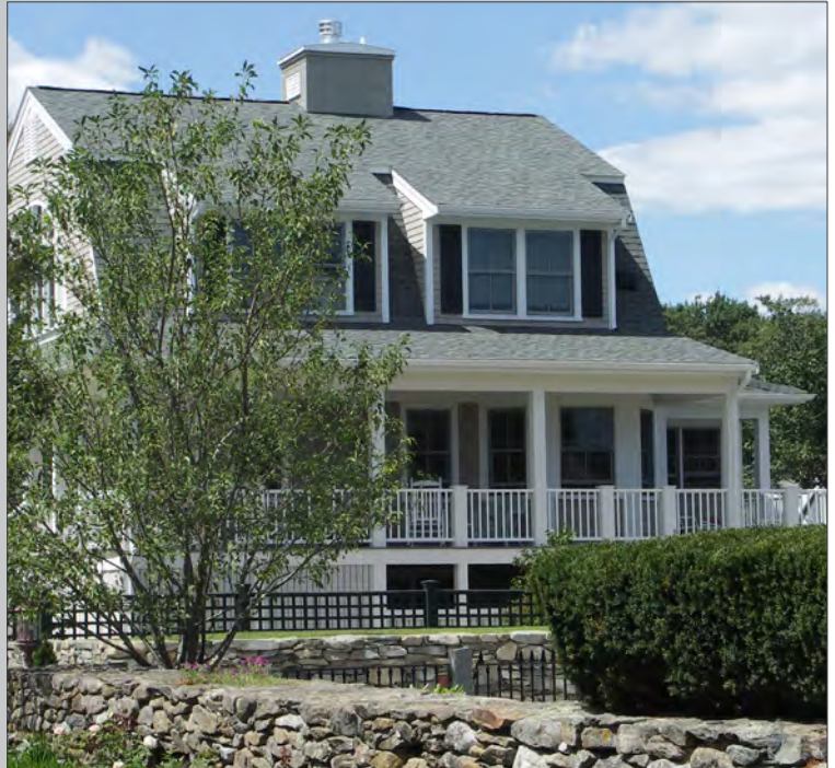
View from South East

The second phase of building for this cottage, creating a separate suite of rooms for the extended family, completes an enclosure around a raised earth platform [required by Massachusetts Health Code regulations for drainfields near the high tide line]. The lower volume reflects the New England lineage of "lean-to's and add-ons", which are clearly secondary to the main building form. The garage shall be located behind the stucco walls of the earth platform, underneath the one story bedroom wing.