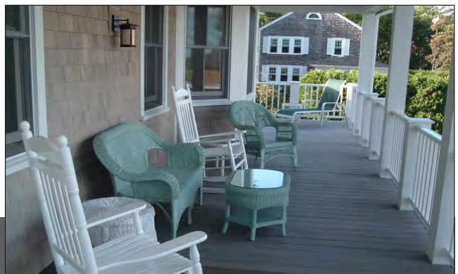
East Porch looking towards Duxbury Bay

HOUSES & HOUSING Shore Setting - Neighborhood Context 1/2 Acre Site