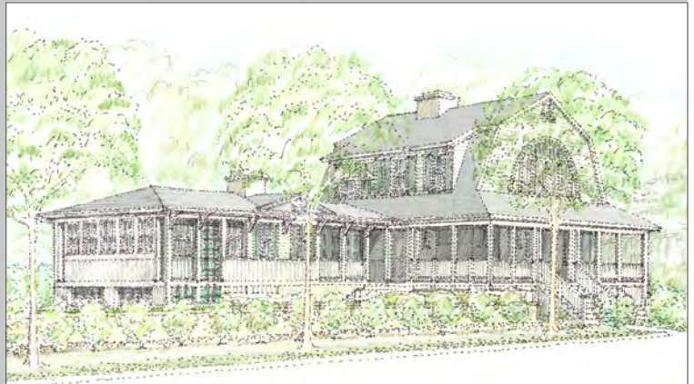
View from Southwest - Phase II Sketch

The second phase of building for this cottage, creating a separate suite of rooms for the extended family, completes an enclosure around a raised earth platform [required by Massachusetts Health Code regulations for drainfields near the high tide line]. The lower volume reflects the New England lineage of "lean-to's and add-ons", which are clearly secondary to the main building form. The garage shall be located behind the stucco walls of the earth platform, underneath the one story bedroom wing.