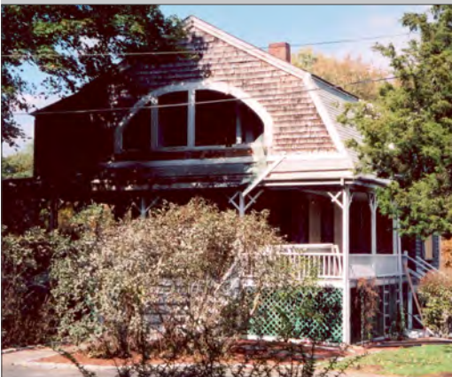
Original House [constructed in 1911]