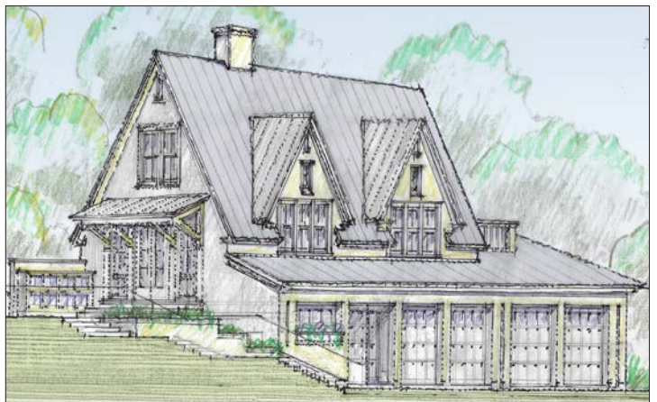
South East View