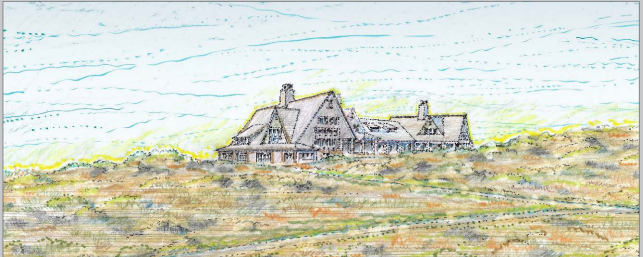
View along Hillside