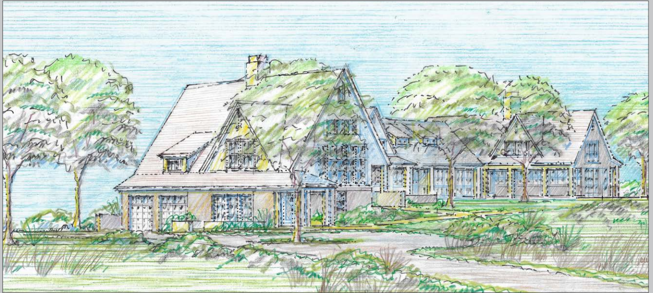
South West View