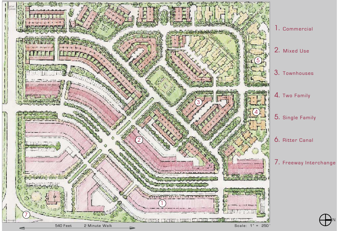
Sketch Plan 2000